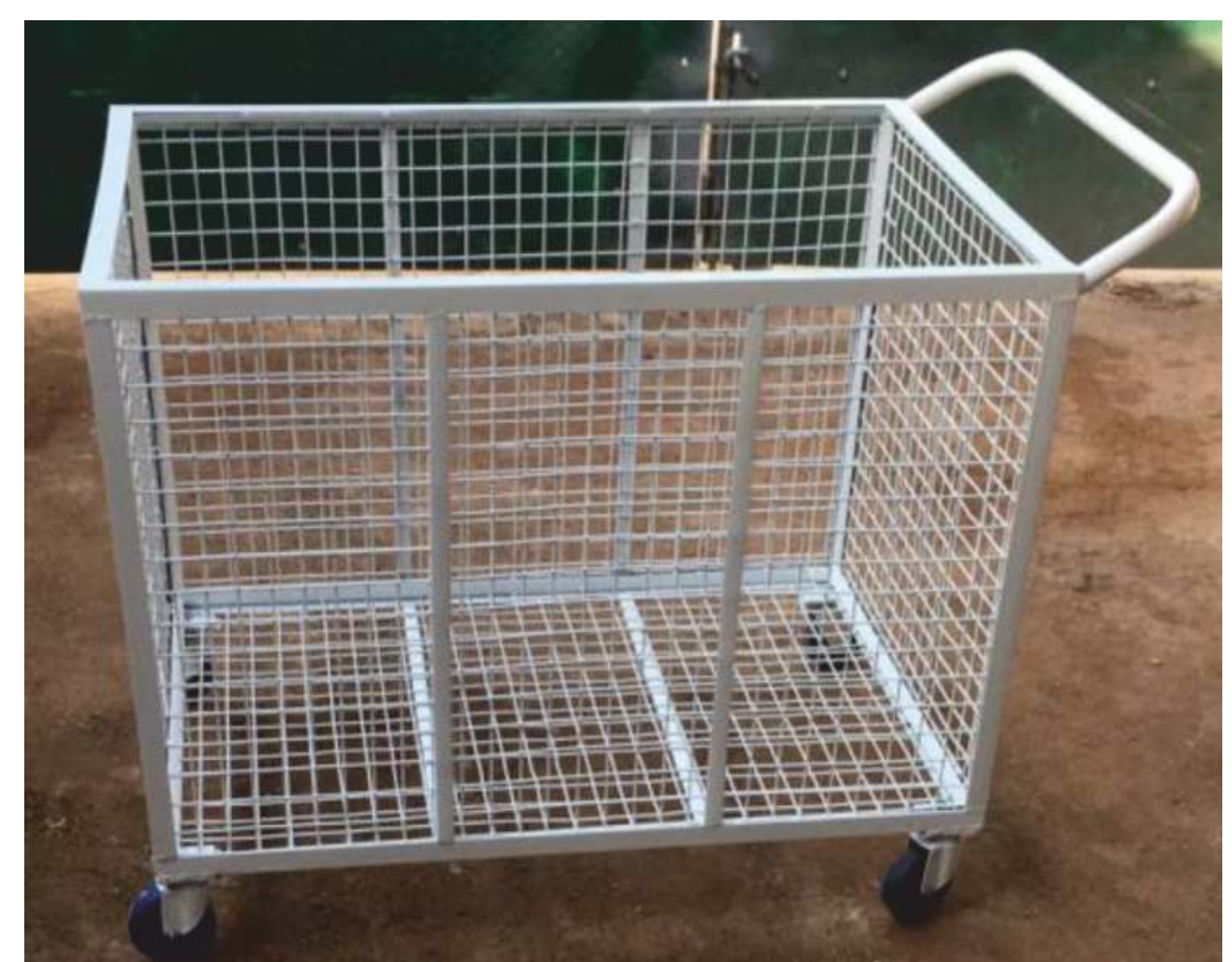
Product - 12