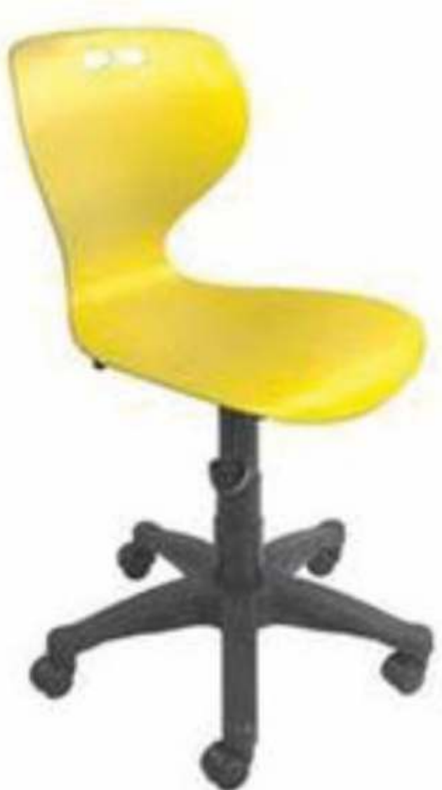
Product - 7