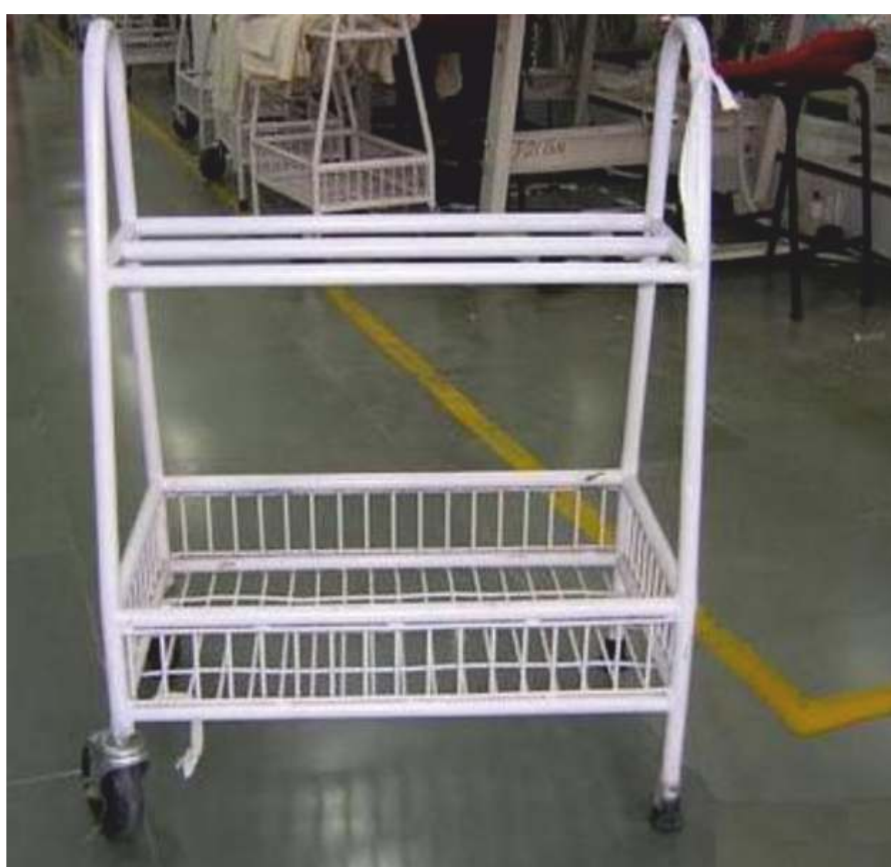
Product - 10