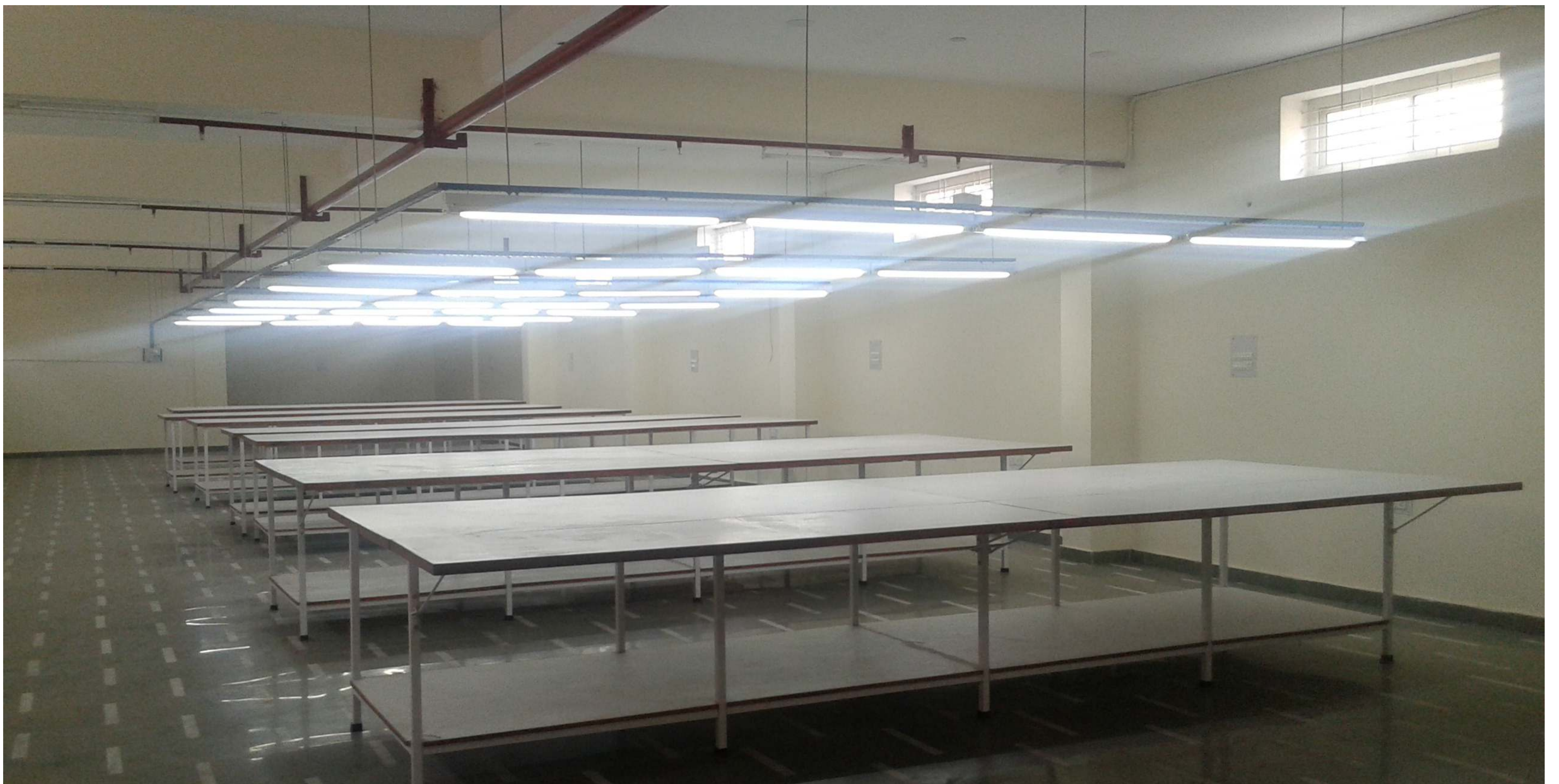
Cutting table all size m.s sq. Pipe 30 mm x 30 mm with powder coated 18 mm pre- laminated borad top & bottom with polished this table is expansion foldable 1fit & 2 fit one side and two side cutting tabel foldable