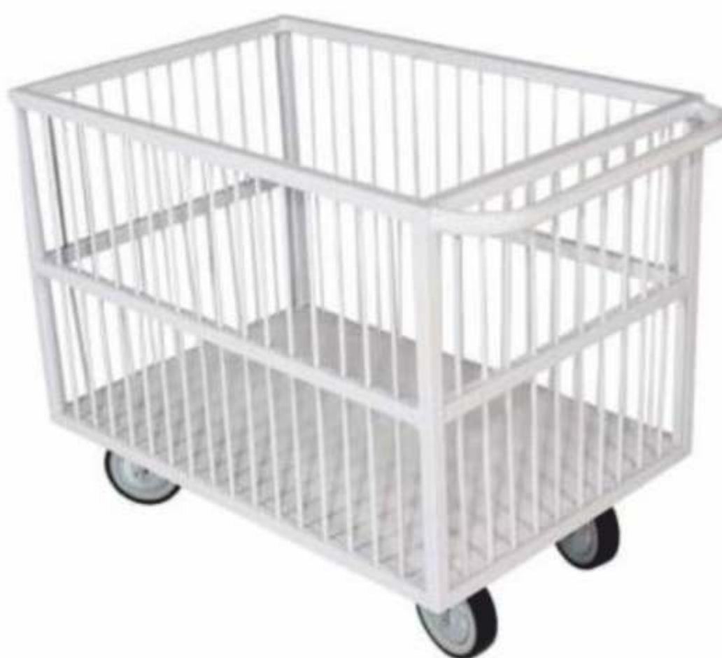
Product - 8