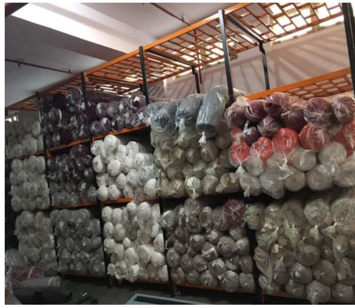
Step 2. Heavy Duty Storage Rack