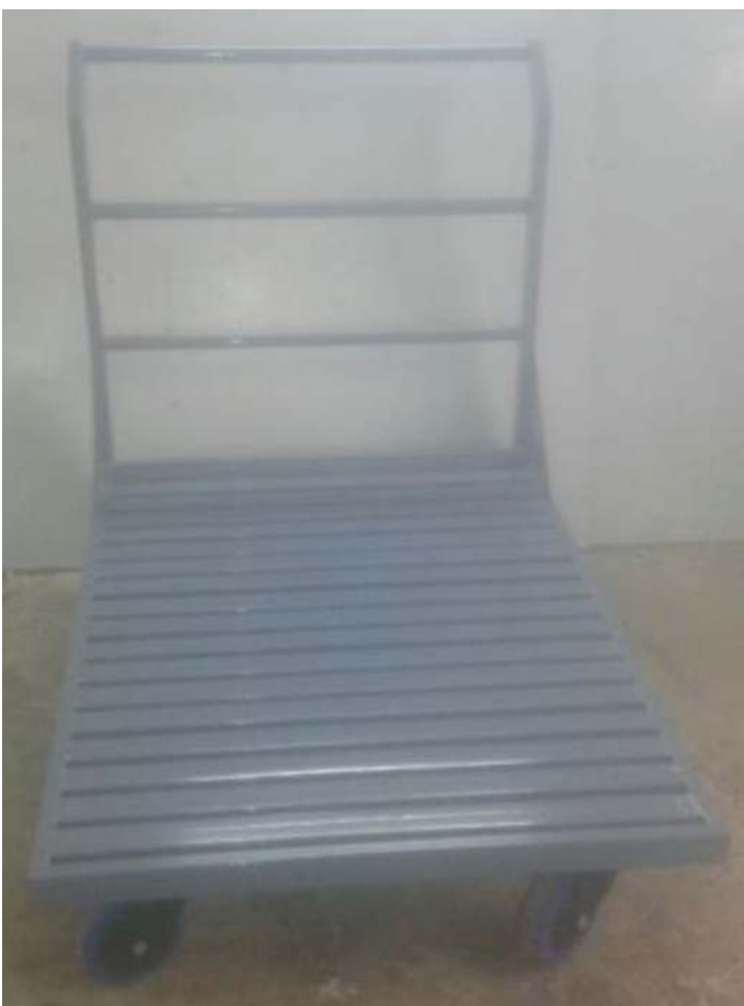
Product - 4