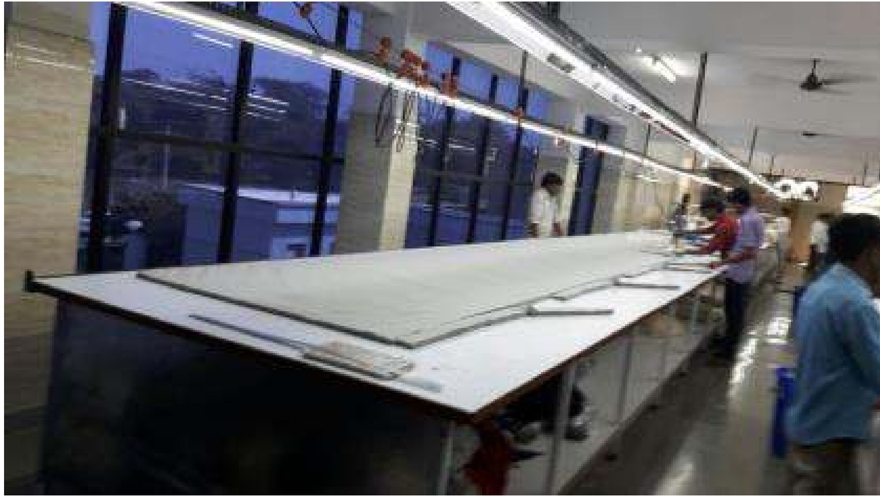
A) CUTTING TABLE