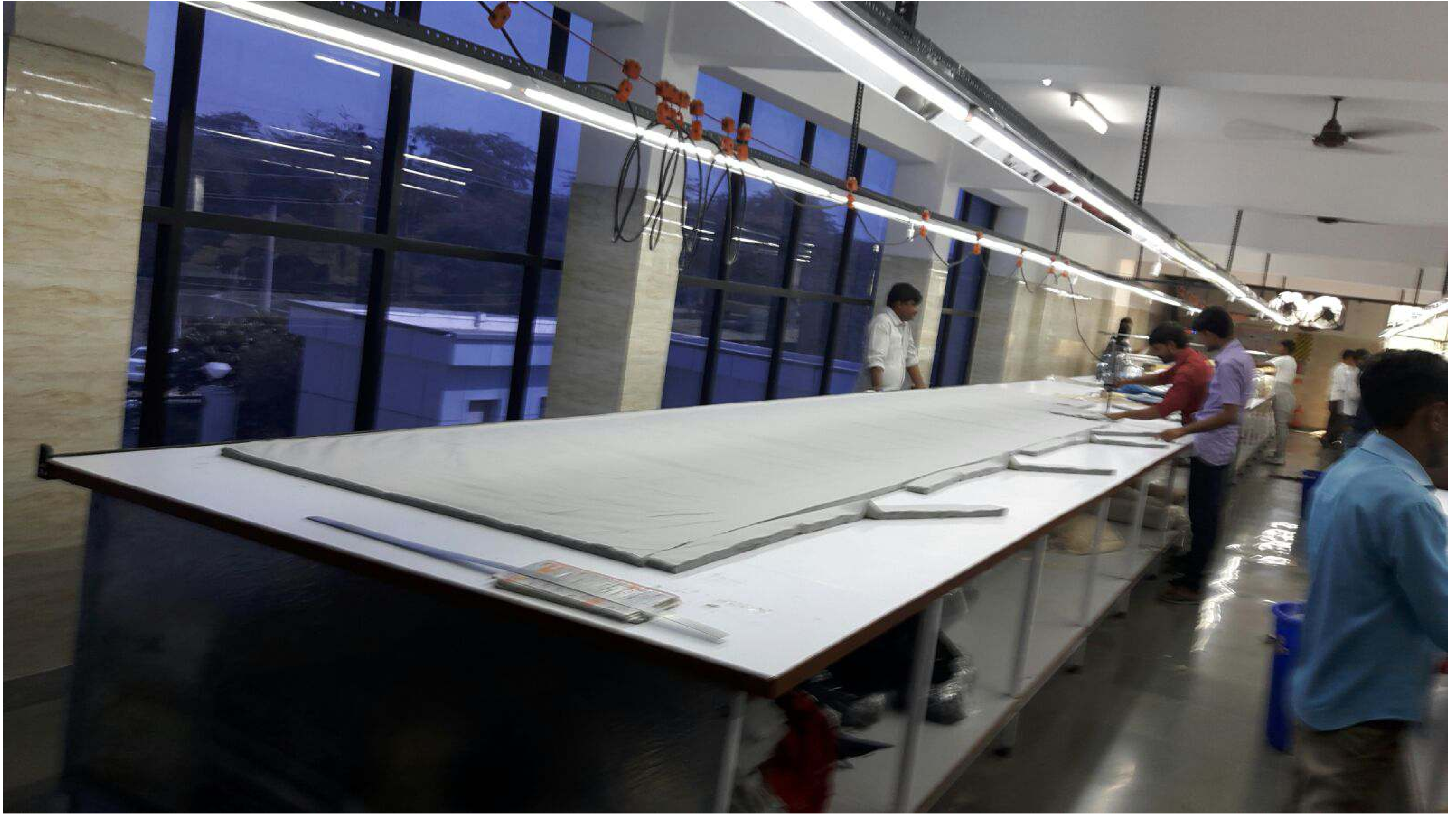
Cutting table all size MS sq. Pipe 30 mm x 30 mm with powder coated top commercial board 19 mm sunmica.08 mm &17 mm pre- laminated board bottom with polished all table high 3ft.