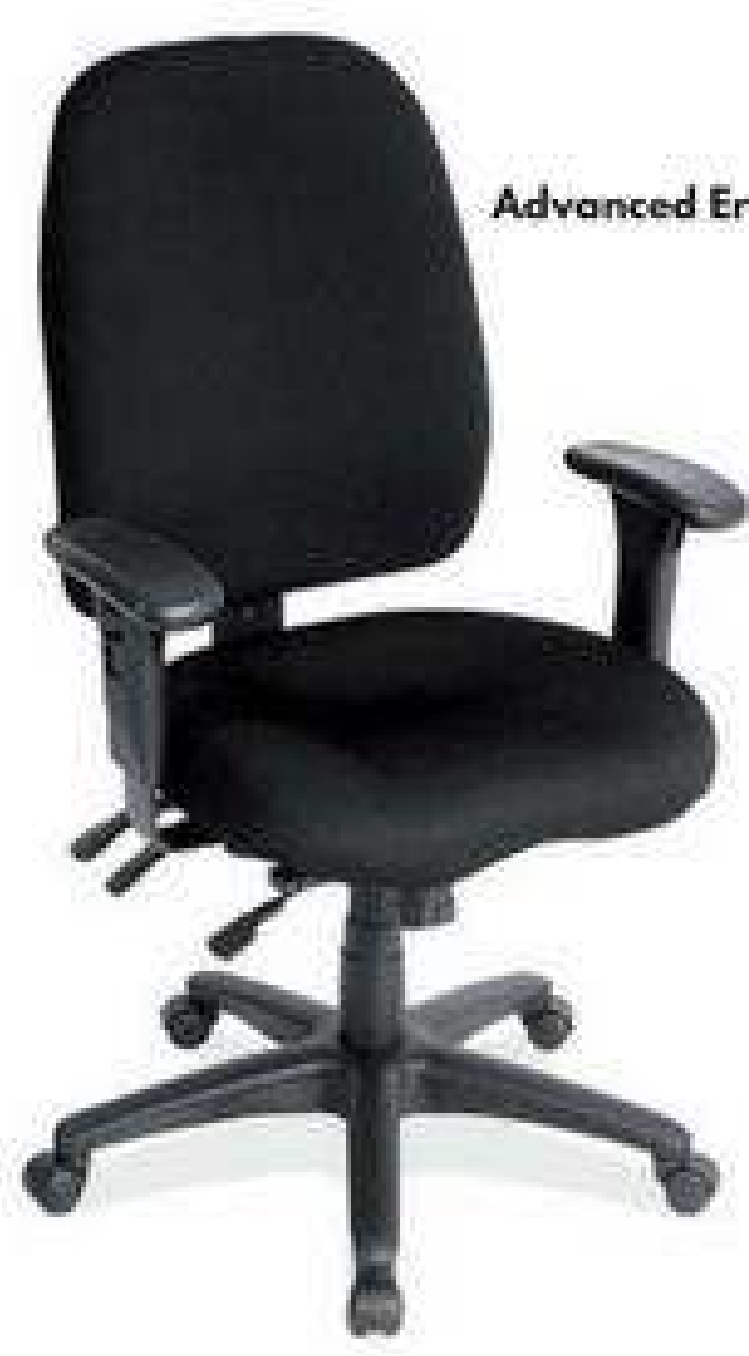
Advanced Ergonomic Series