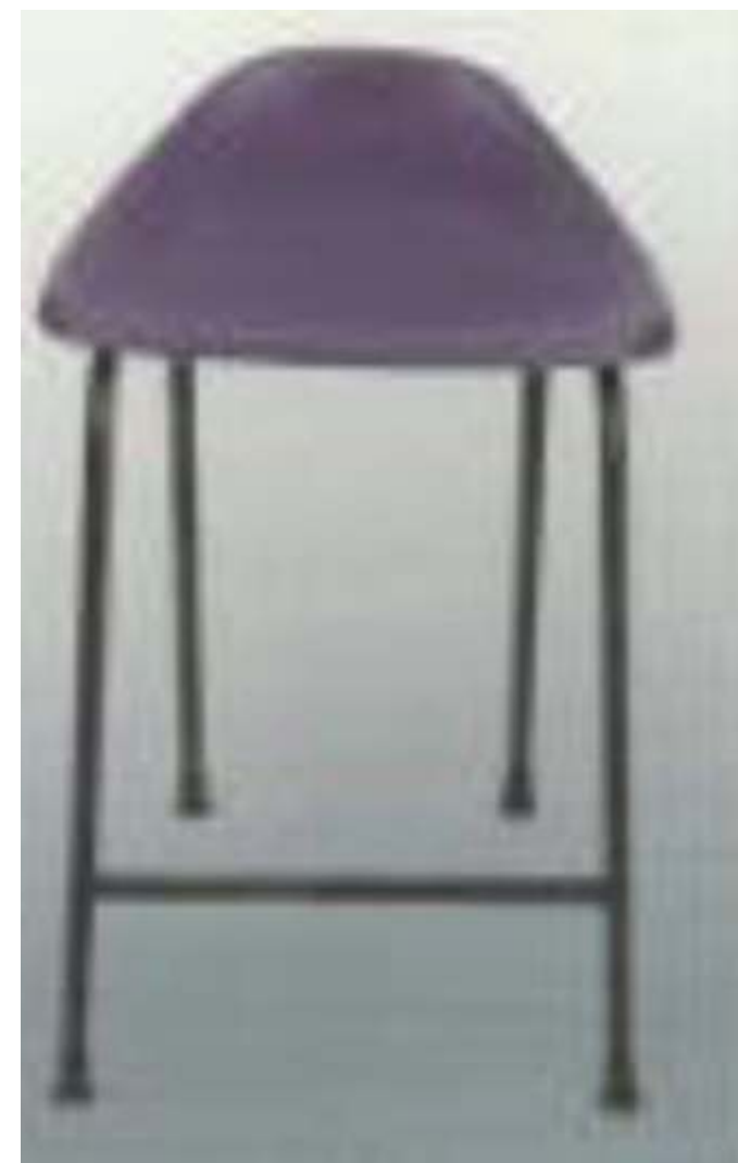
Product - 2