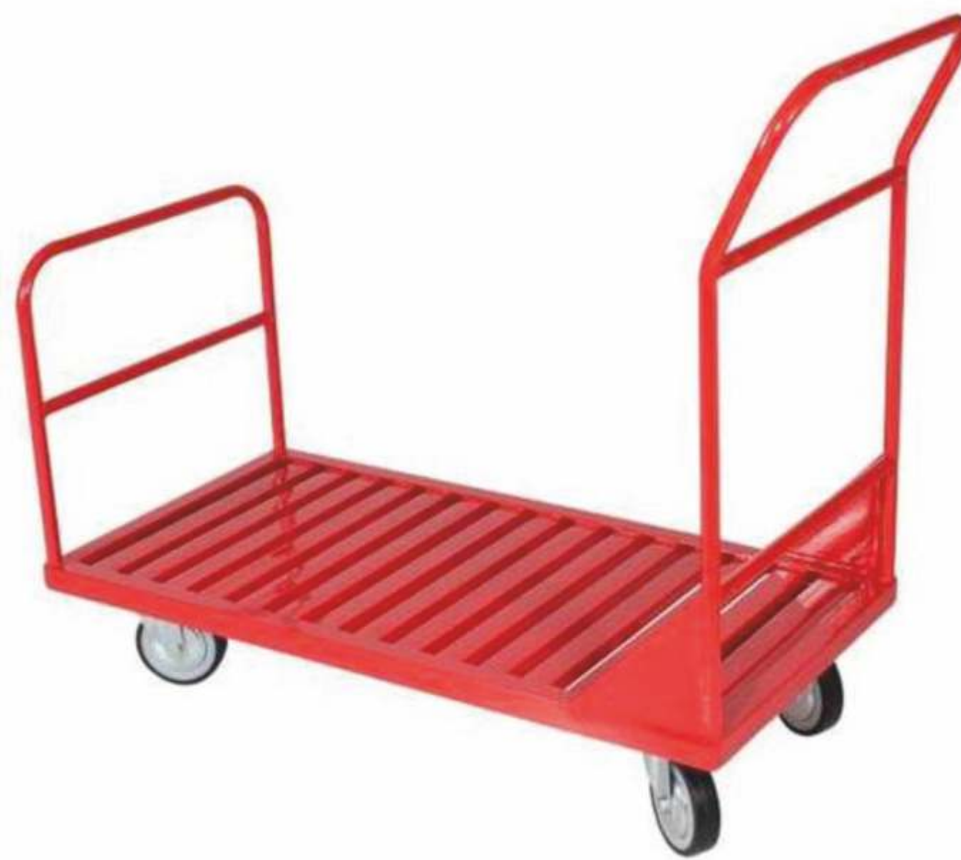
Product - 5