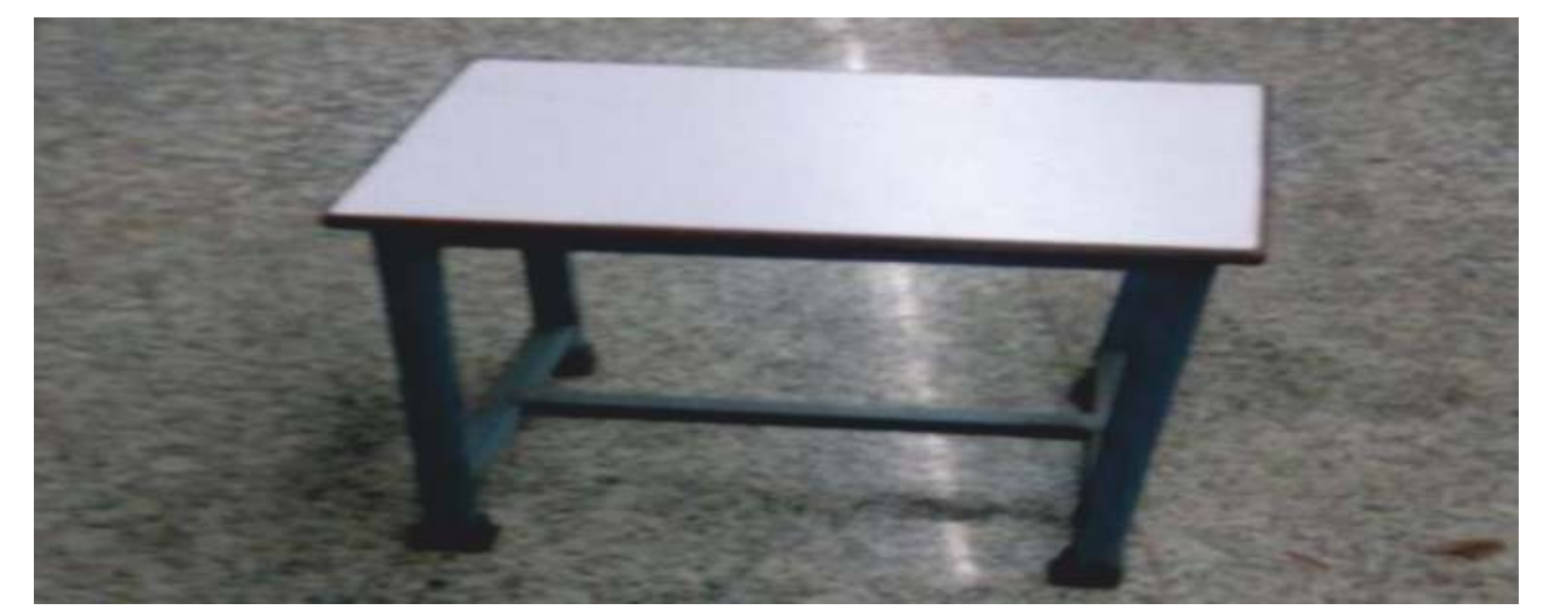
Product - 3