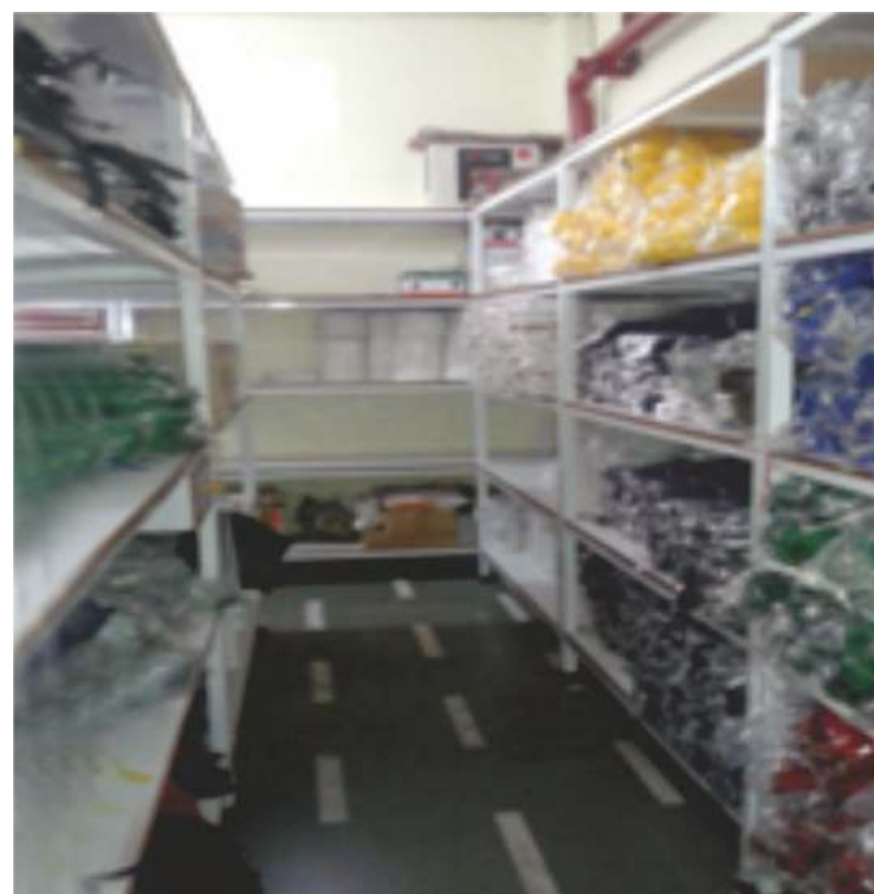
Step 11. Good Finishing Stock Racks