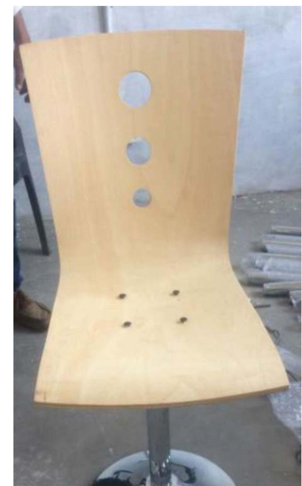
Product - 6