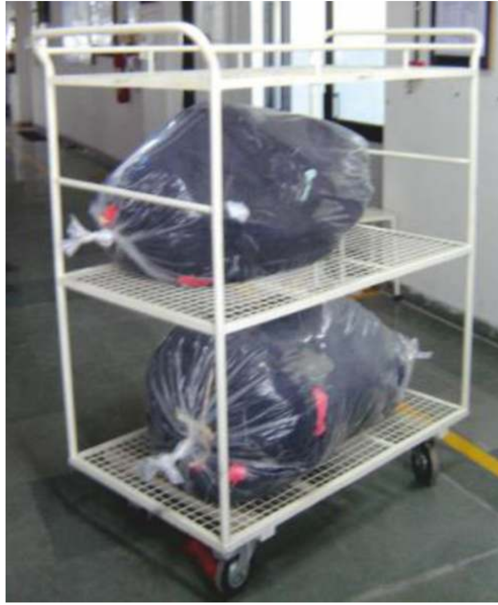
Product - 1