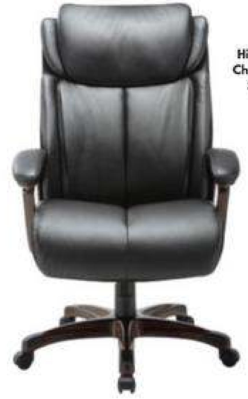
Highback Charleston Series