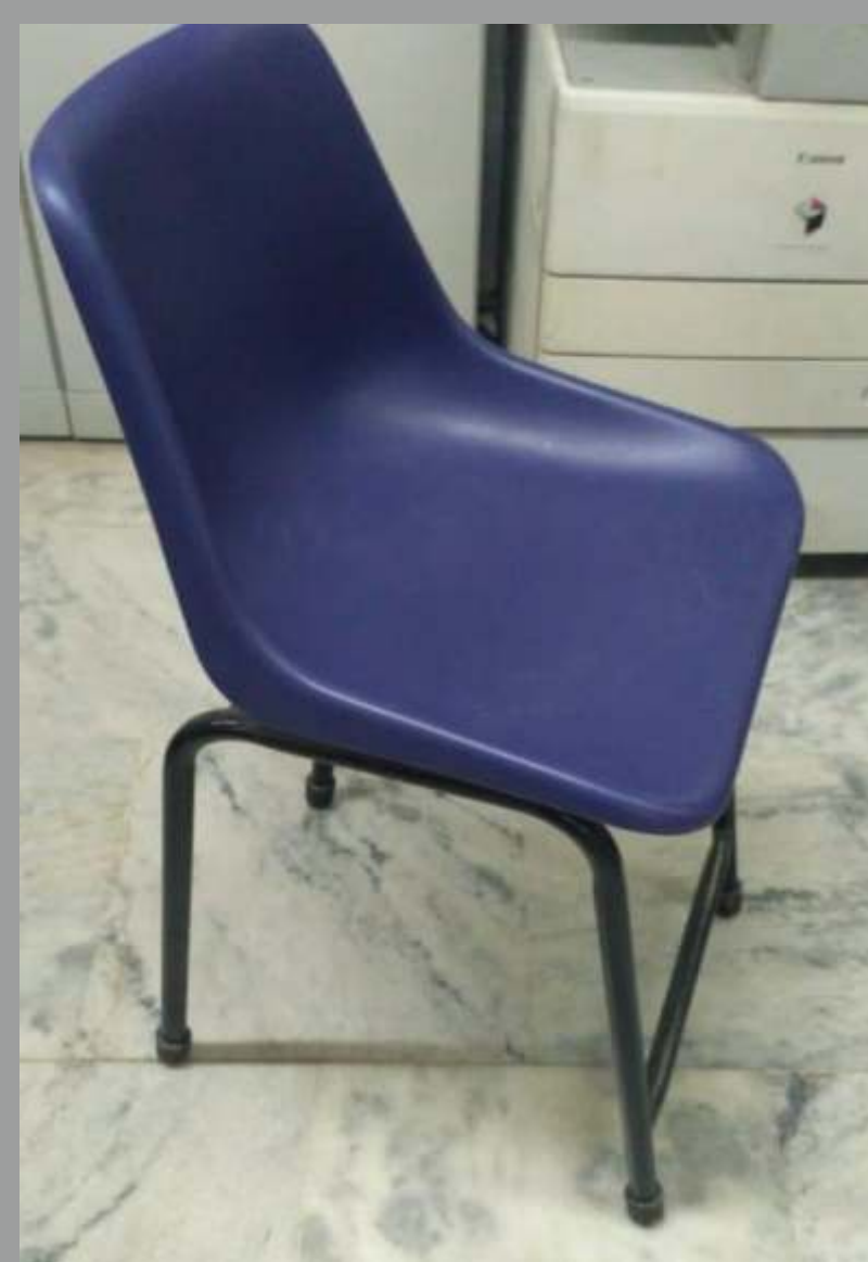
Product - 8