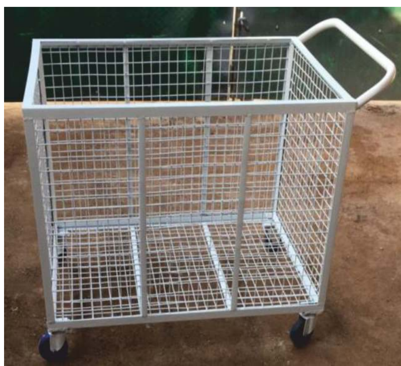
Step 4. Raw Material Move Stitching Unit Trolley