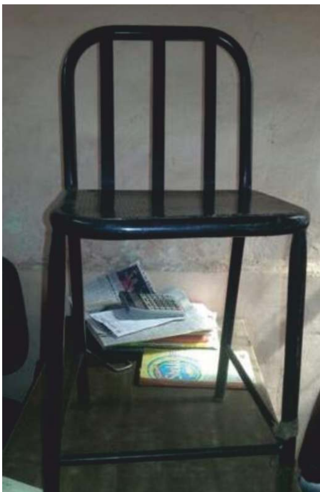
Product - 4