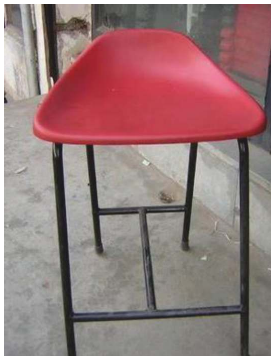
Product - 5