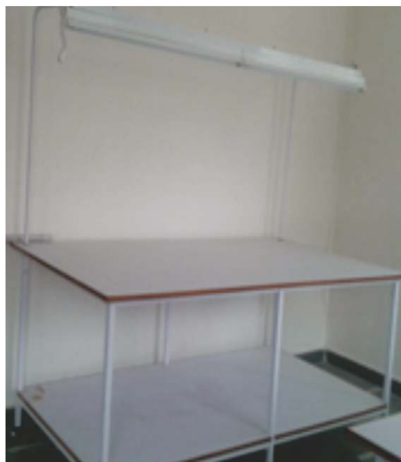
Step 8. Thread Cutting And Checking Table