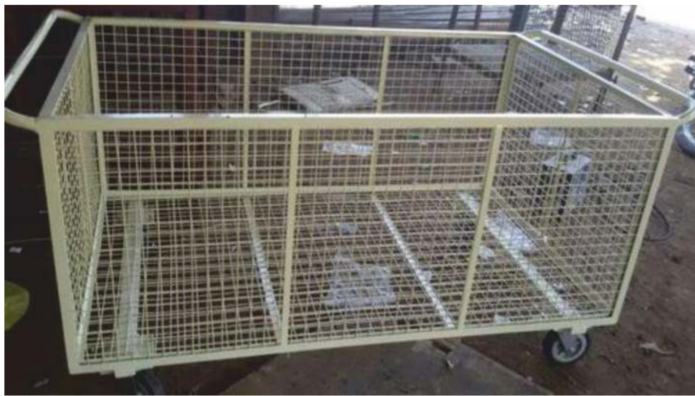
Product - 7