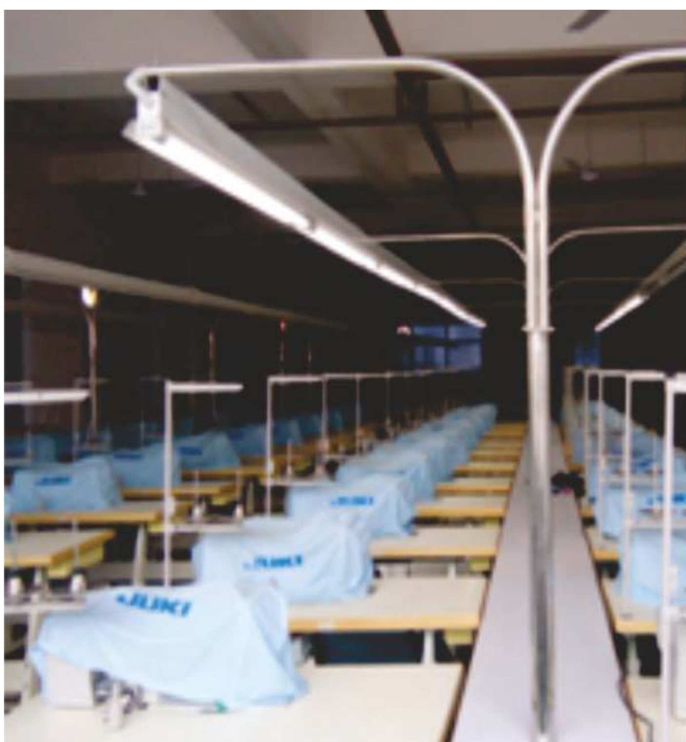
Step 7. Stitching Unit Ss Busbar