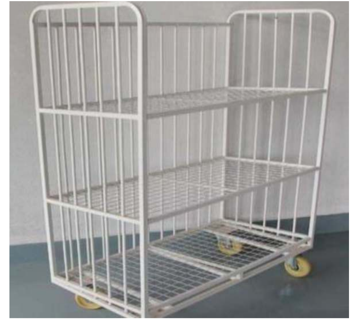
Product - 3