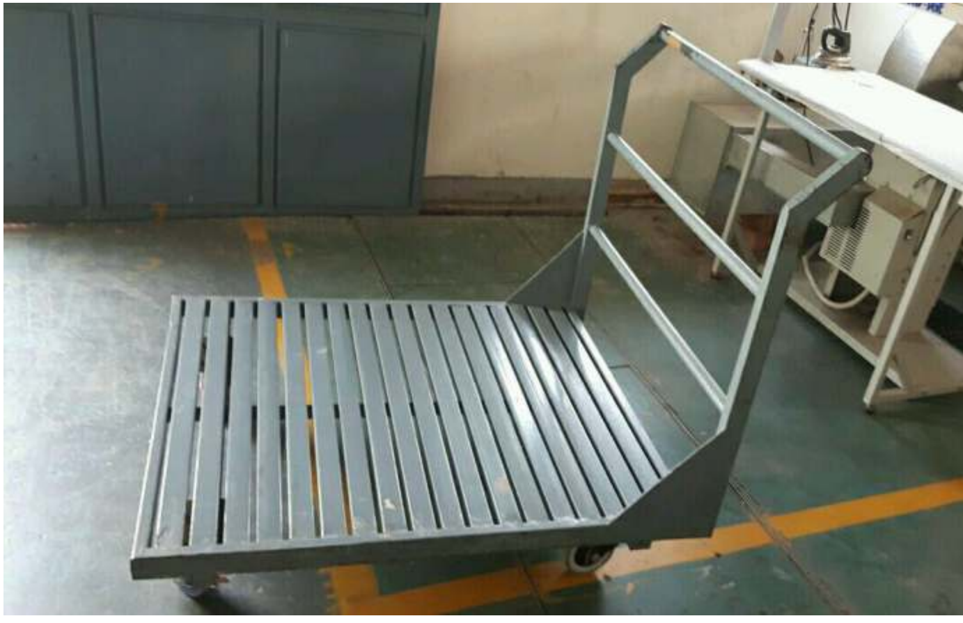
Step 1. Heavy Duty Loading Trolley