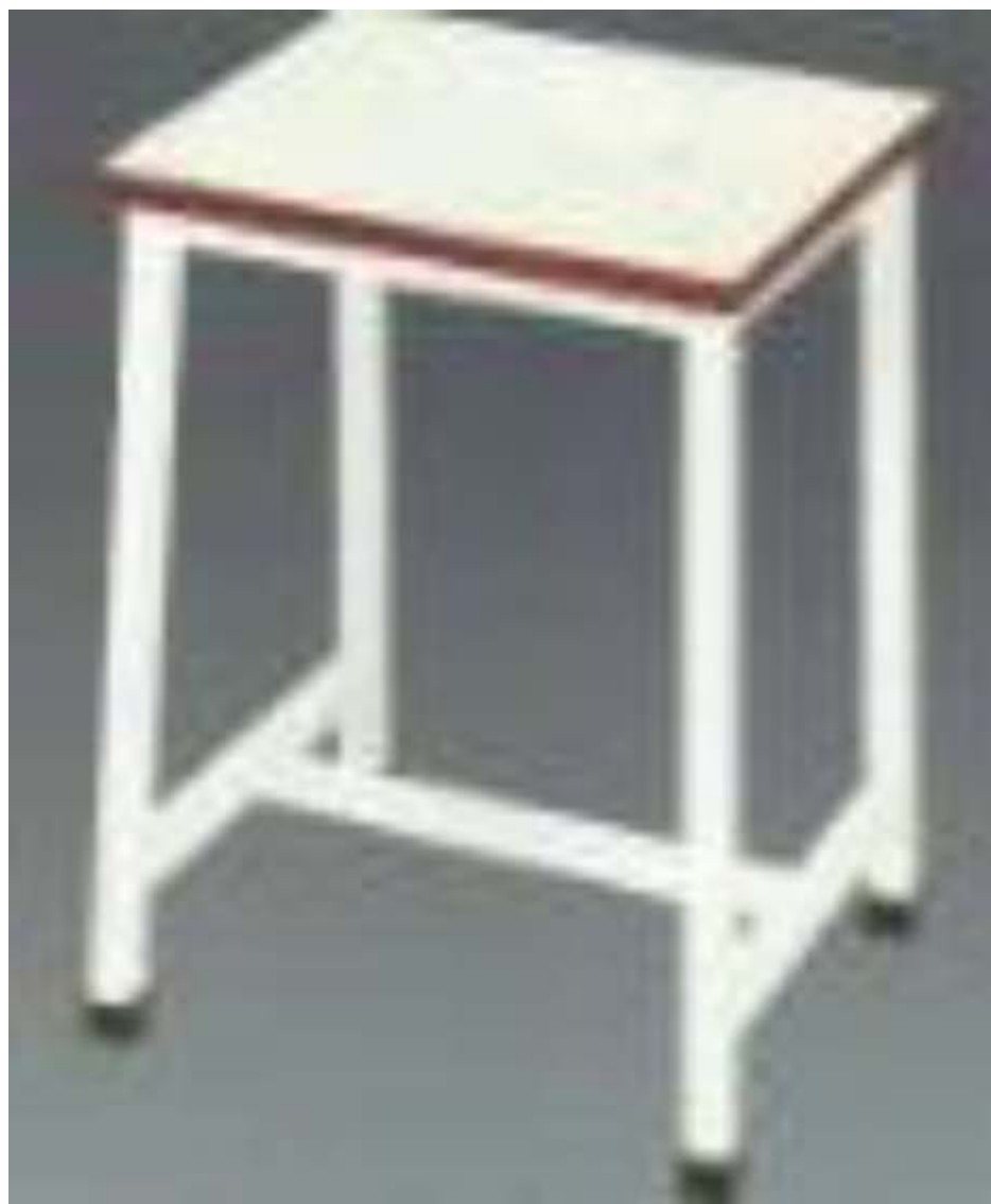
Product - 1