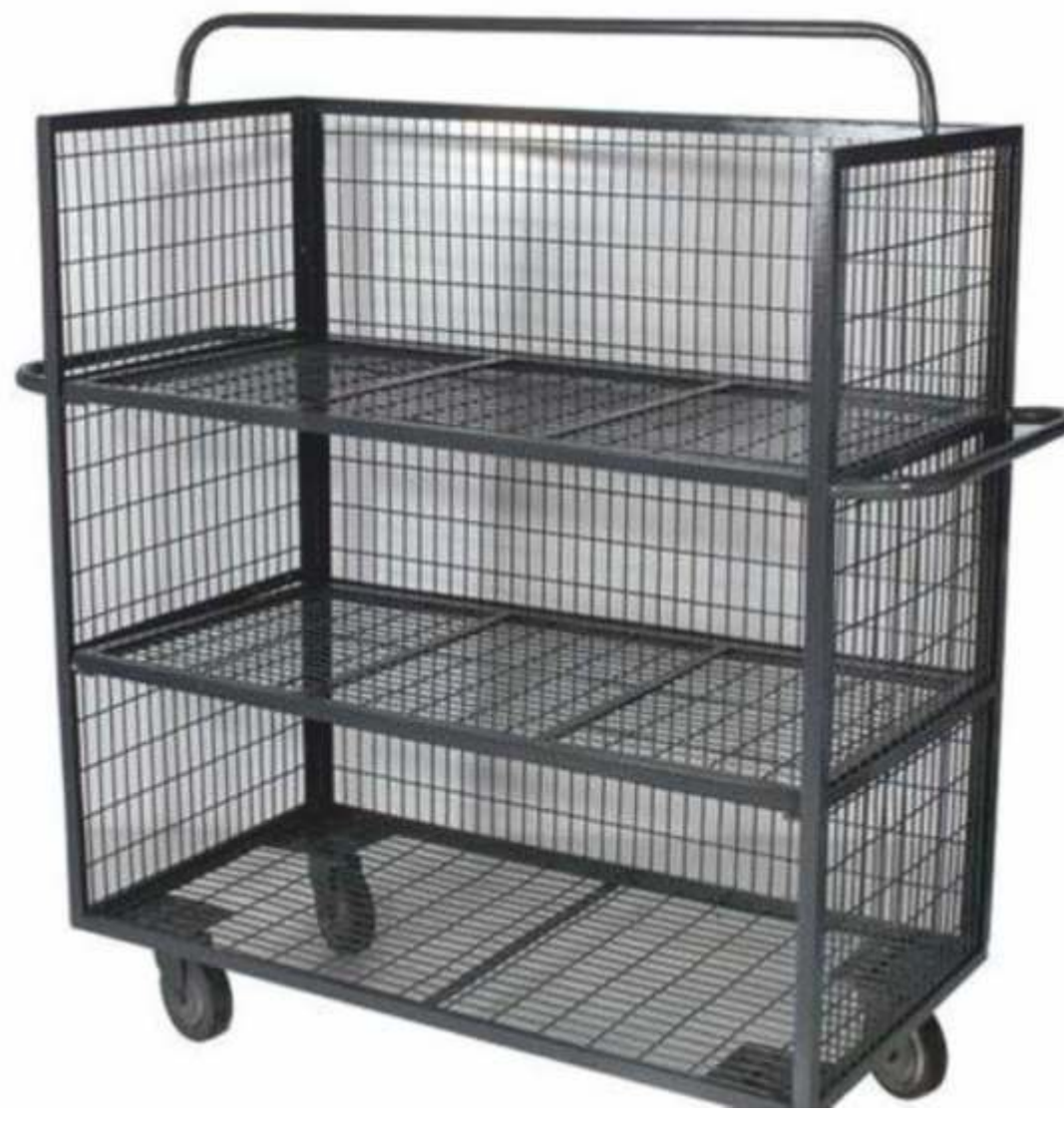
Product - 2