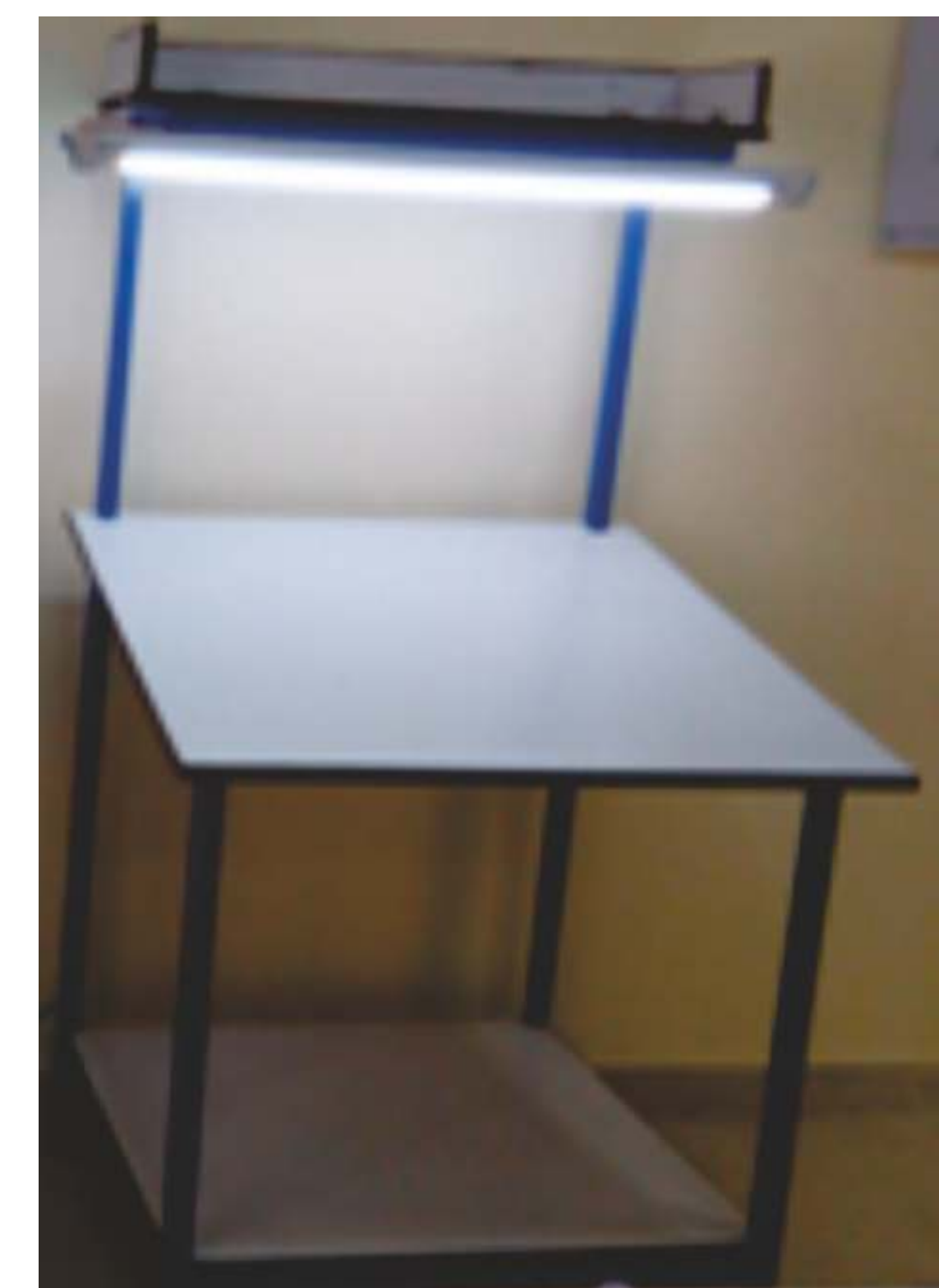
Step 9. Qc Tabel