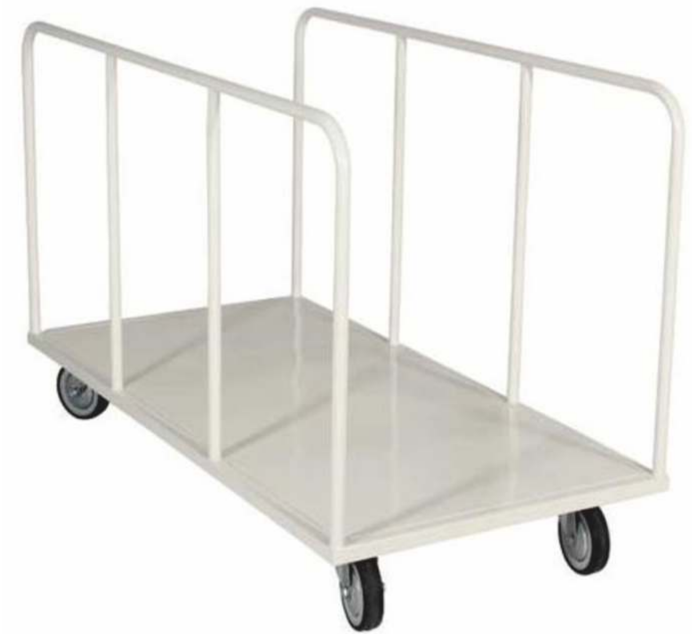
Product - 6