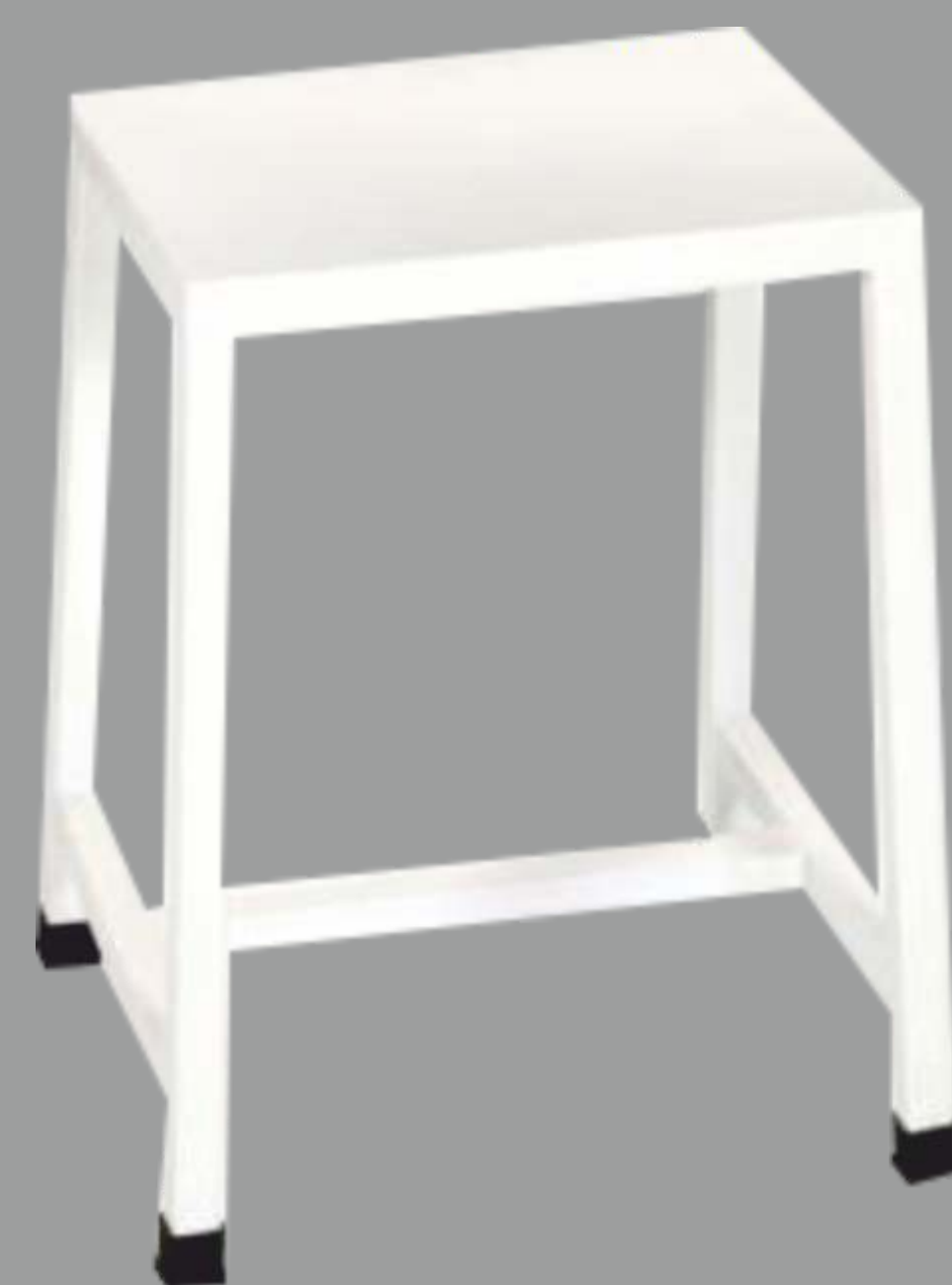
Product - 9