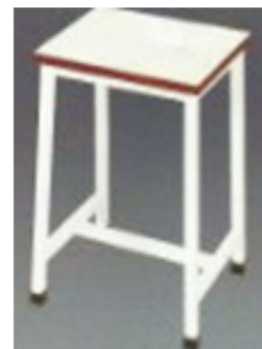
Step 6. Tailor Work Stools