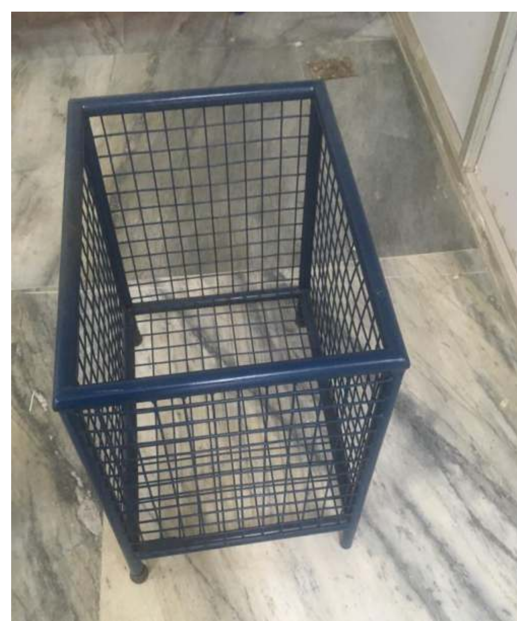
Step 5. Tailor Work Basket