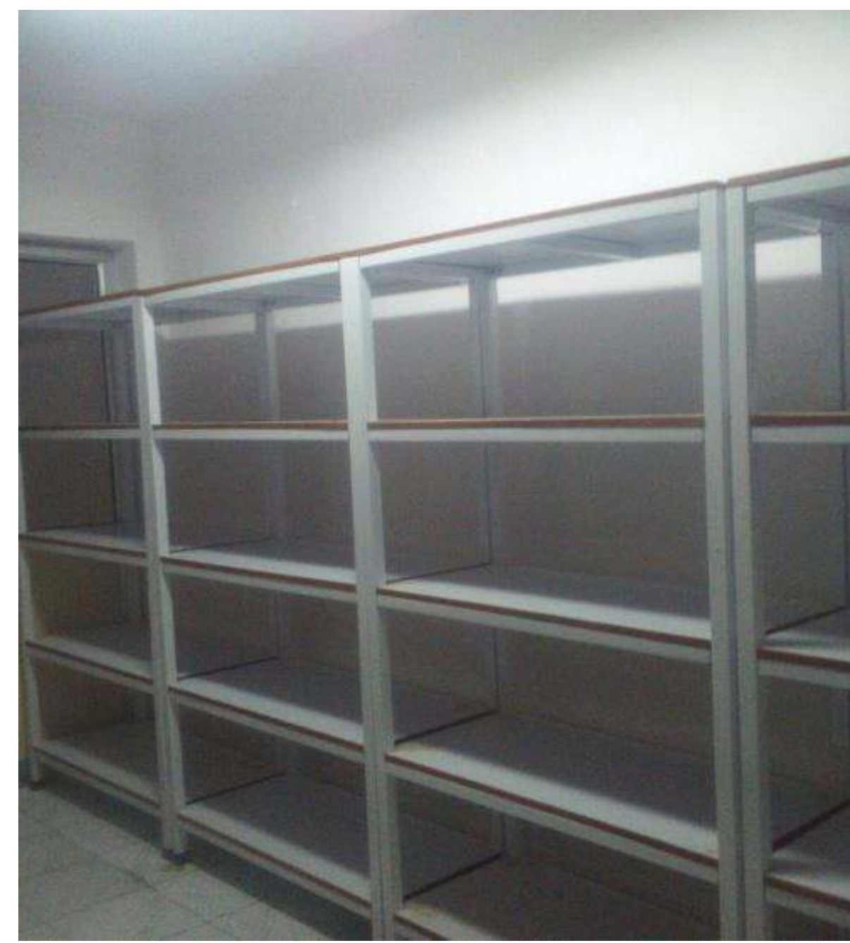
B) ACCESSORIES RACK