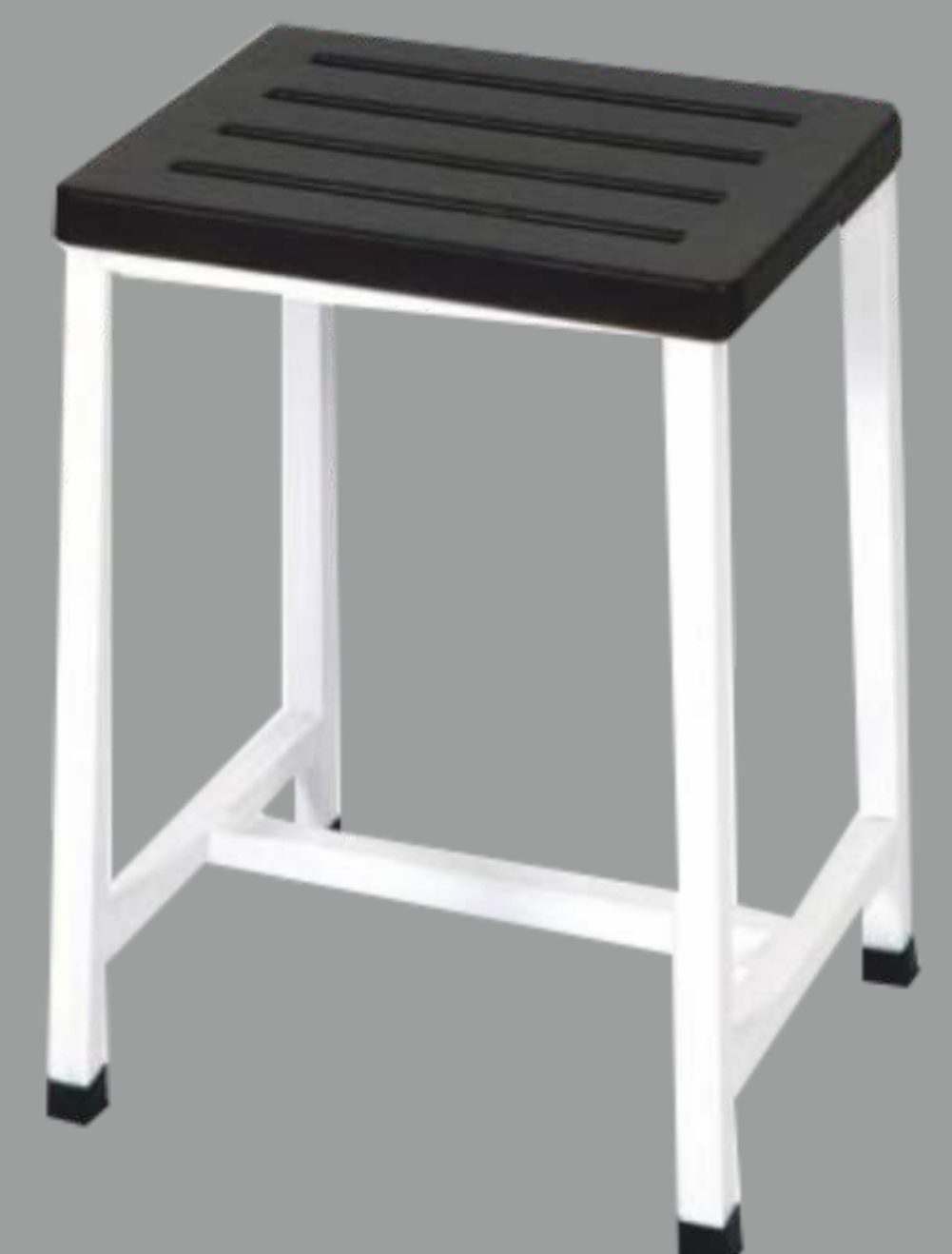
Product - 10