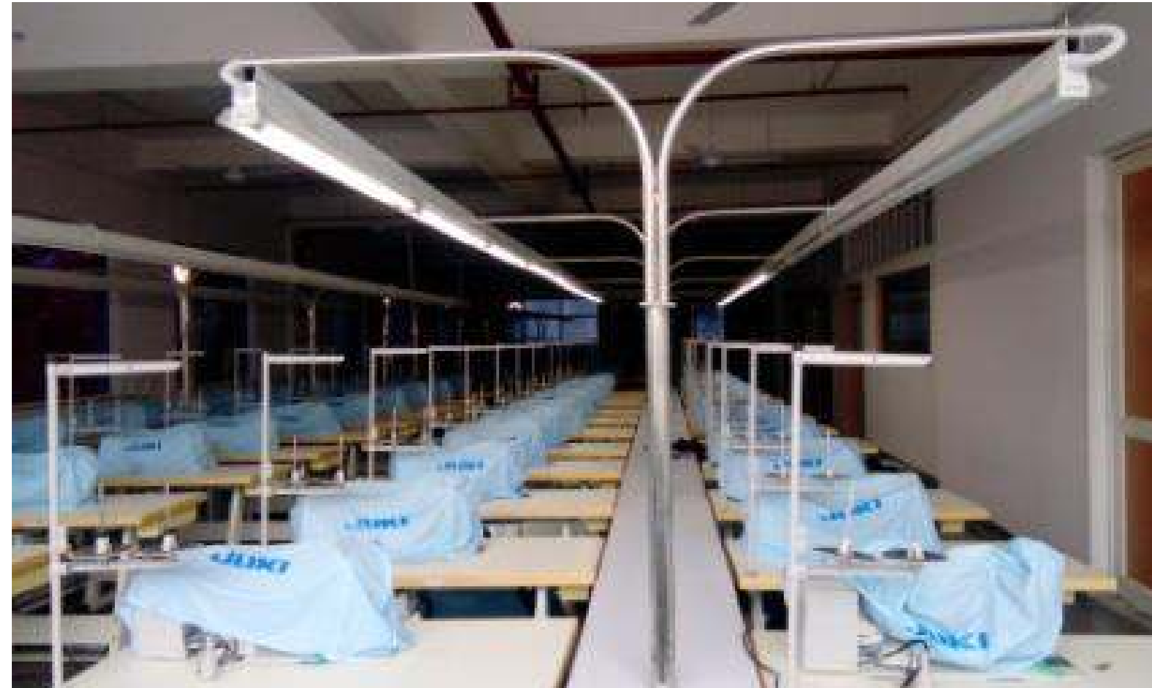
B) PRODUCTION LINE TABLE