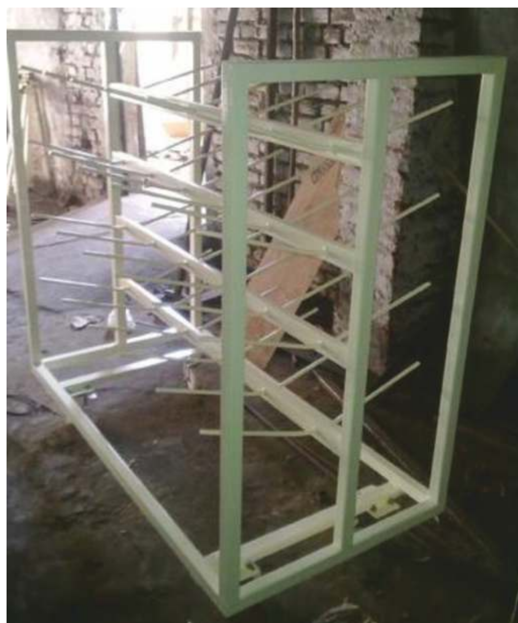
Product - 11