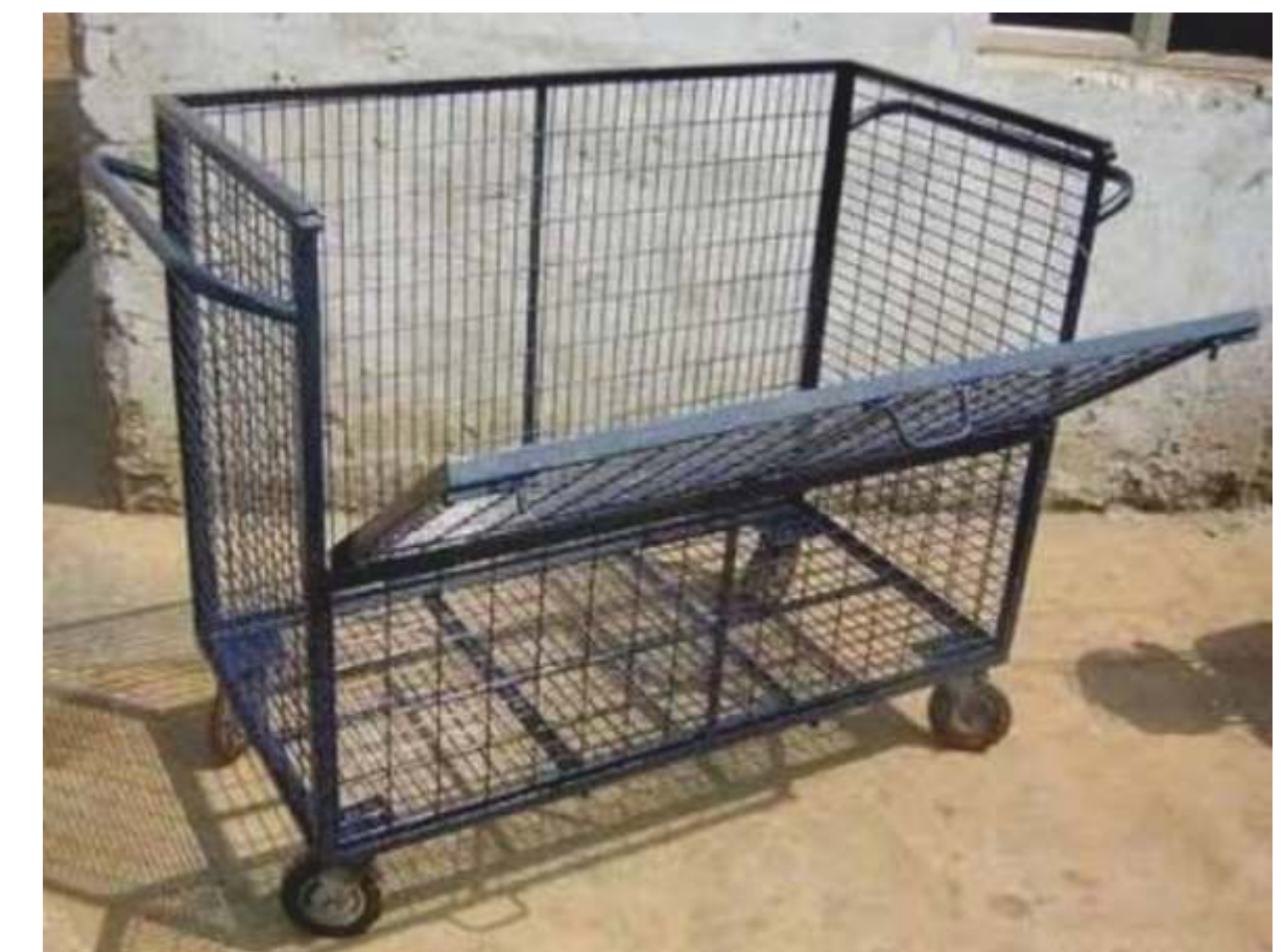
Product - 9