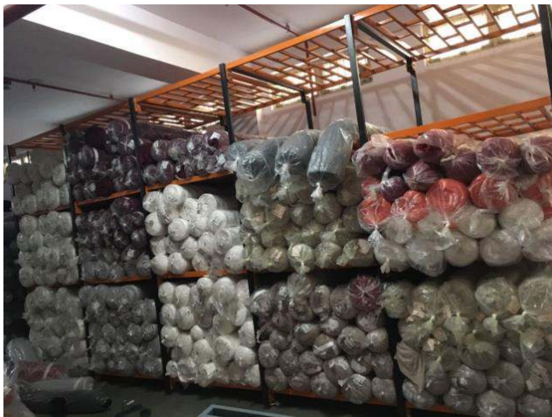
A) HEAVY DUTY RACKS